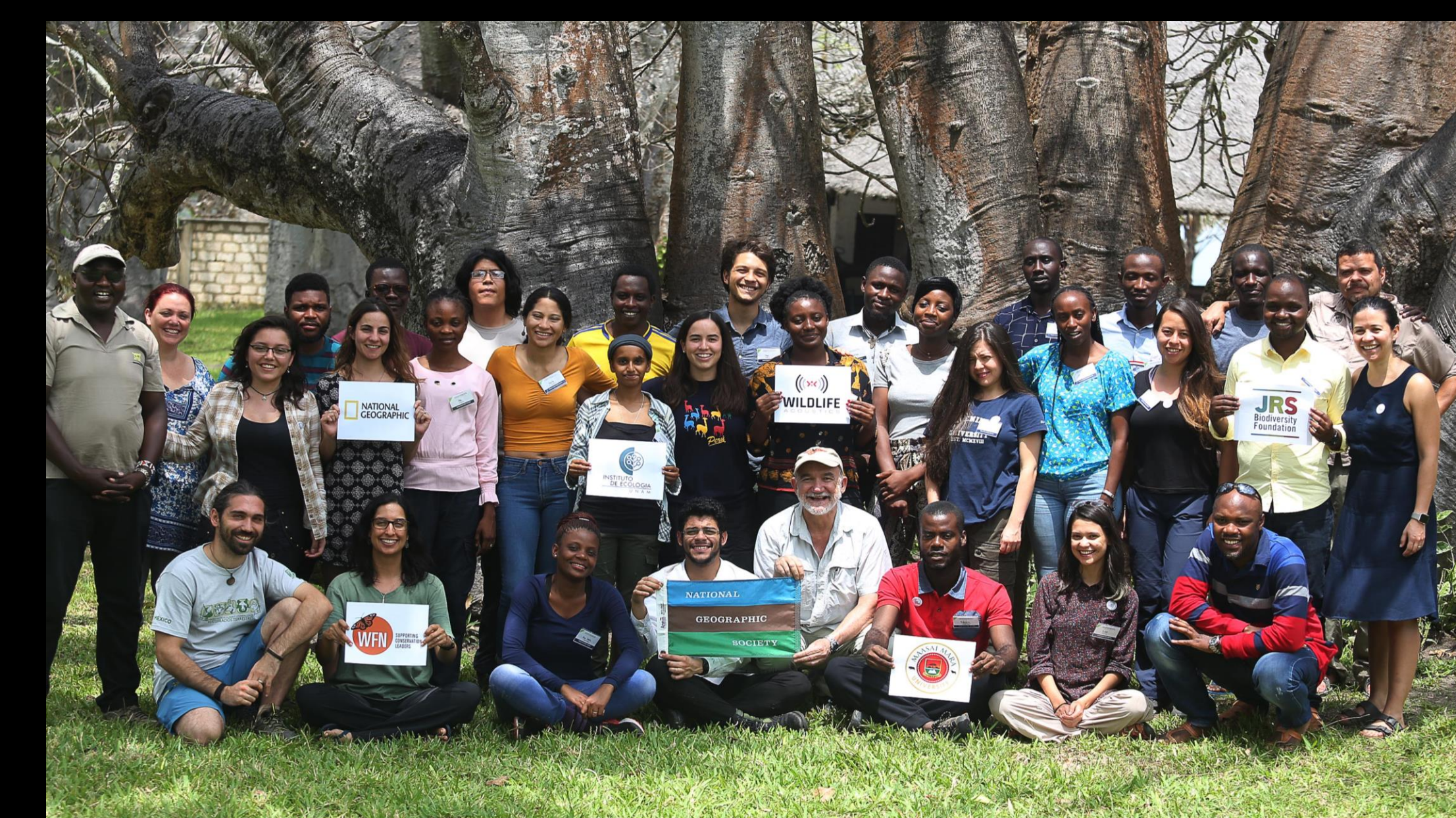
Field training course to connect African & Latin American graduate students with Global South Bats

Bat Conservation Africa aims to provide a platform for connecting conservation actions & scientific research across Africa with our partner networks