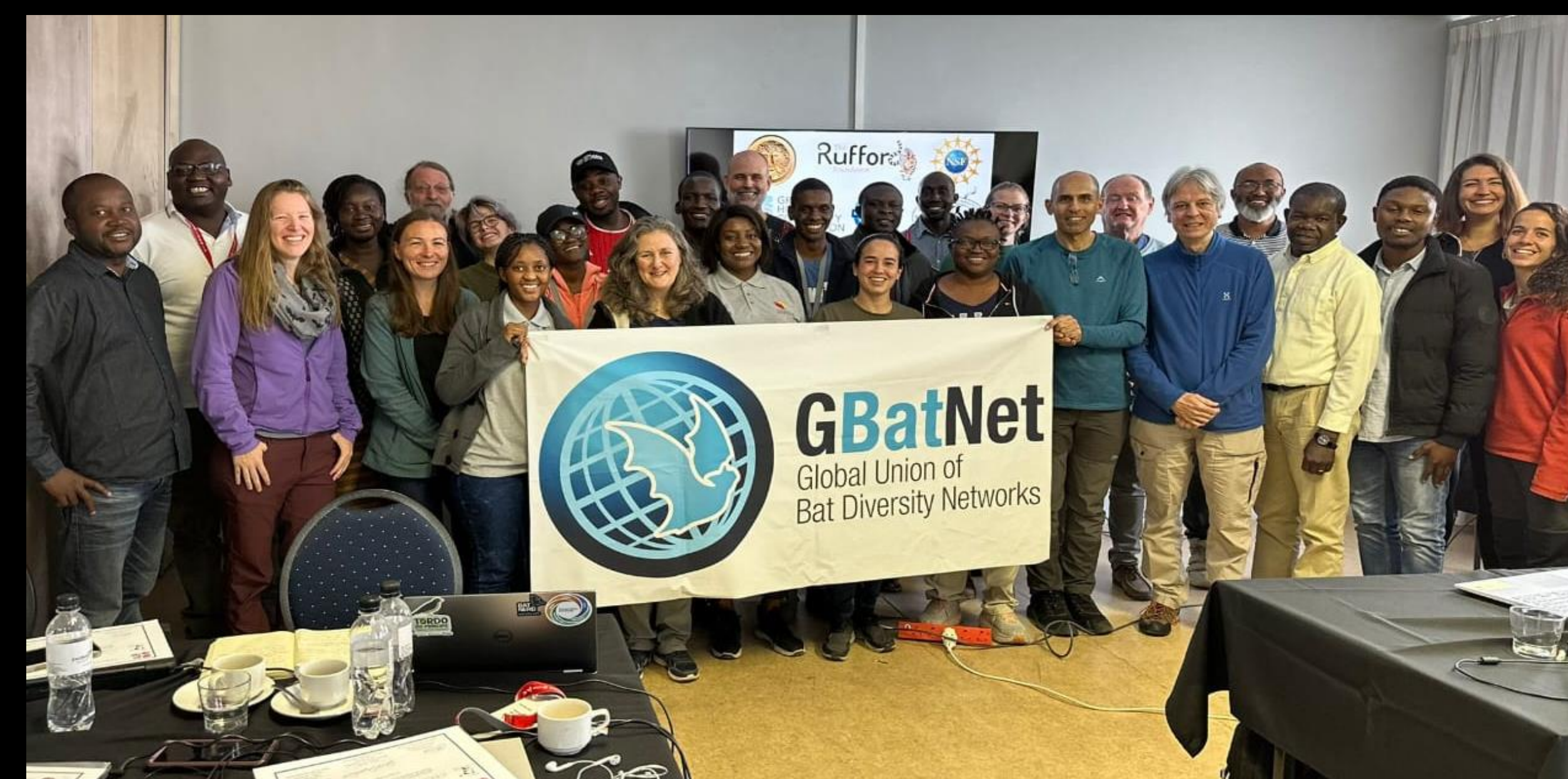
IUCN RedList assessment workshop & training with GBatNet & IUCN SSC Bat Specialist Group in Namibia

BCA is and has offered free online training in a selection of conservation courses from WildTeam to students from more than 8 countries thanks to support from the Rufford Foundation and Bats Without Borders.