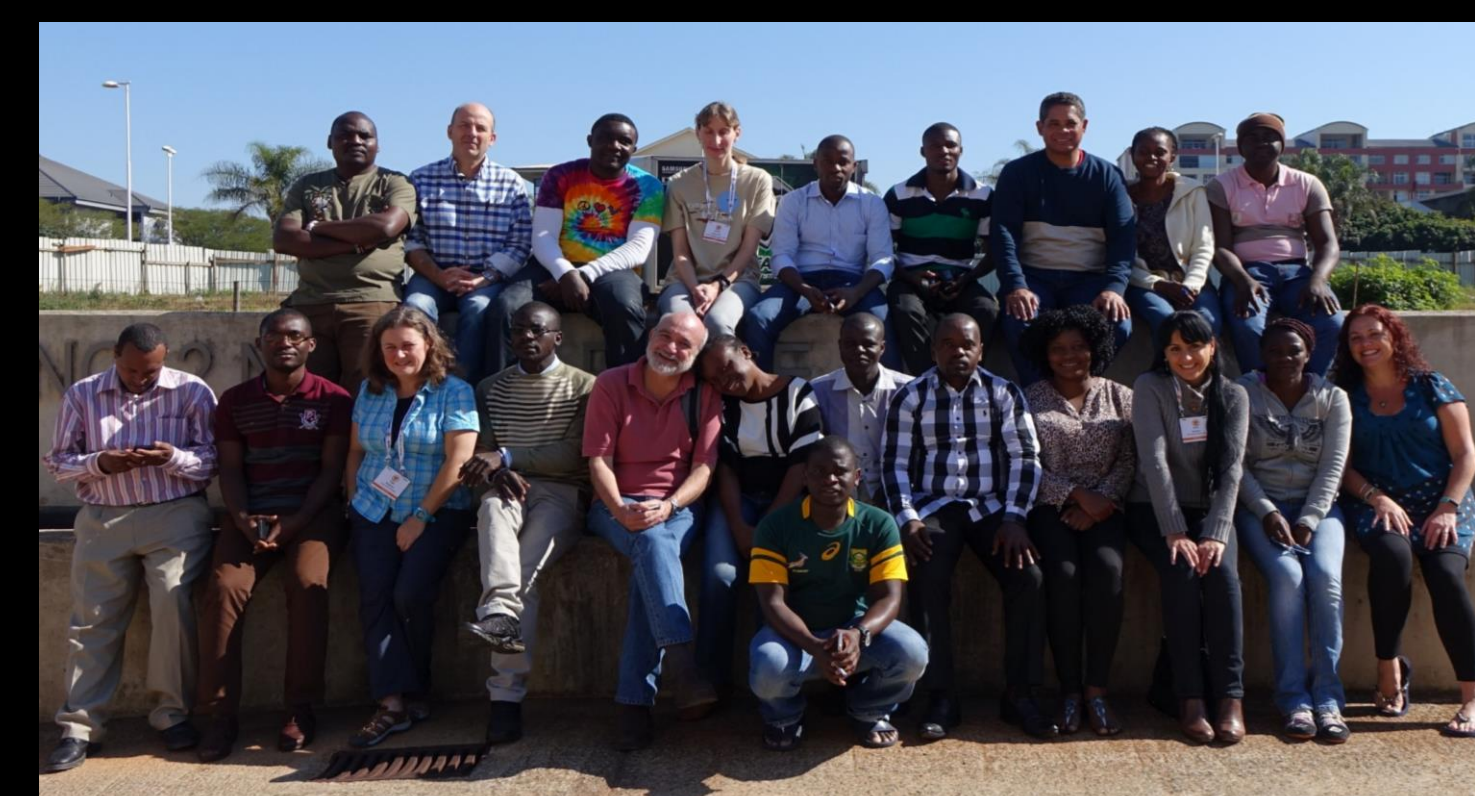
BCA Workshop after the 17 th IBRC in Durban, South Africa